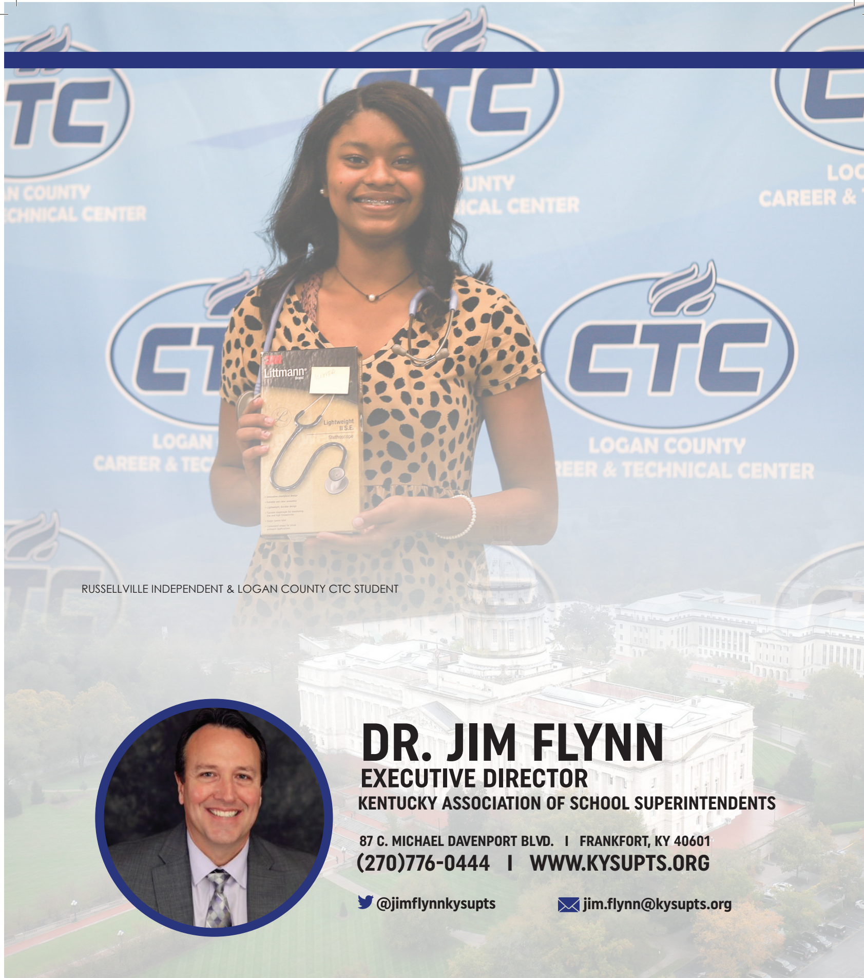
RUSSELLVILLE INDEPENDENT & LOGAN COUNTY CTC STUDENT